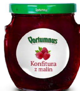
Raspberry confiture 50%