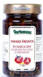
Dried tomatoes in oil with pepper