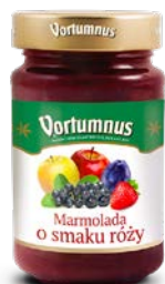
Rose flavoured marmalade

Juicy apples, intense red strawberries, fleshy plums and the healthiest berry fruit in the world - chokeberry. Marmalades are an irreplaceable addition to baking cakes, shortbread cookies, buns, muffins and croissants.