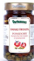
Dried tomatoes in oil with capers