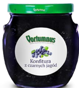
Blueberry confiture 50%