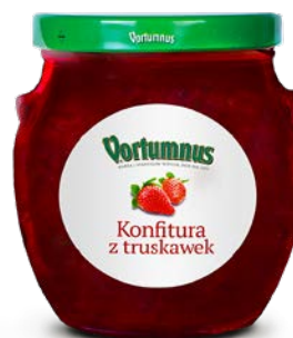
Strawberry confiture 50%