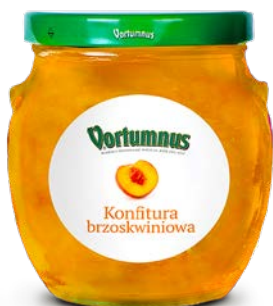
Peach confiture 50%

Jam is an irreplaceable addition to bread, toast, porridge, yoghurt, pancakes, waffles, pancakes, pancakes, omelets or desserts.