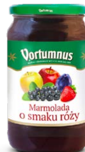
Rose flavoured marmalade