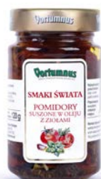
Dried tomatoes in oil with herbs

Intensely red tomatoes in an aromatic marinade with the addition of chili, capers, marinated green pepper and aromatic herbs. A great addition to many dishes - especially in Italian and Mediterranean cuisine.