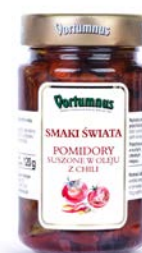
Dried tomatoes in oil with chili